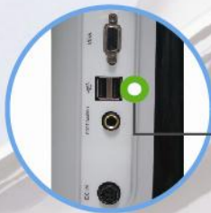
DICOM 3.0 (optional), USB