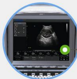
Clips for quick recall (CINE, Still images)