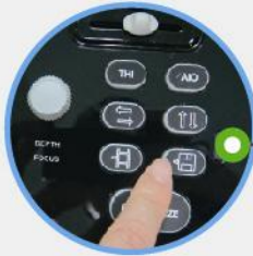
One- key quick save