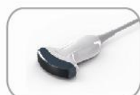
3.5MHz Convex C3-A