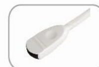
5.0 MHz Micro-Convex MCSV-A