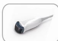
3.0 MHz Micro-Convex MC3-A