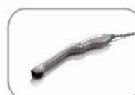
6.0 MHz Transvaginal V6-A