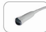
6.0 MHz Micro-Convex MC6-A