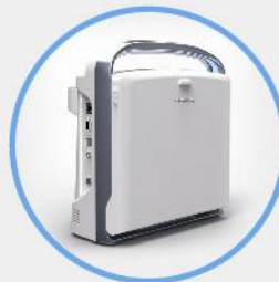
Ultra - Light