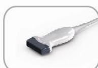
5.3-10.0MHz Linear L7M-A