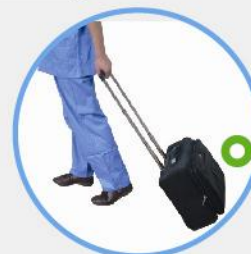
Carry bag (optional): go anywhere you want