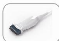
5.3-11.0MHz Linear L7S-A