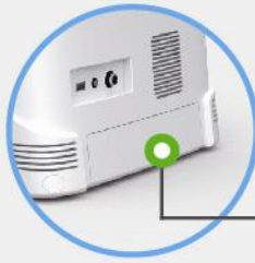
Built-in battery (optional) 2 hours for outdoor use